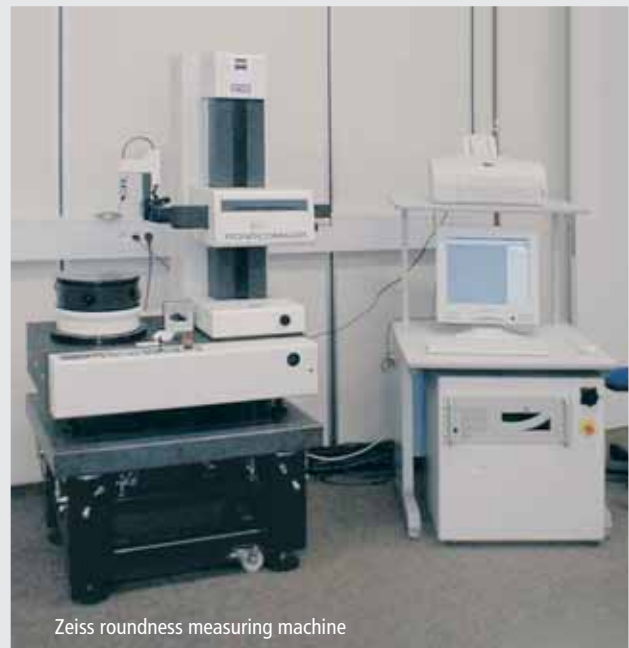
Zeiss roundness measuring machine