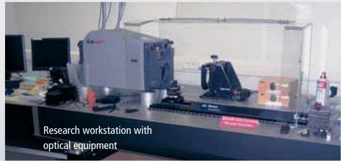
Research workstation with optical equipment